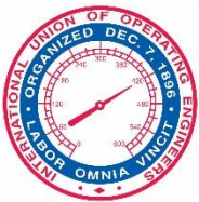
California-Nevada Conference of Operating Engineers