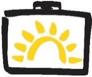
California Small Business Association